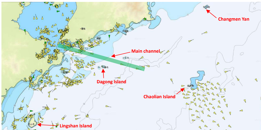
An illustration of key navigable waters